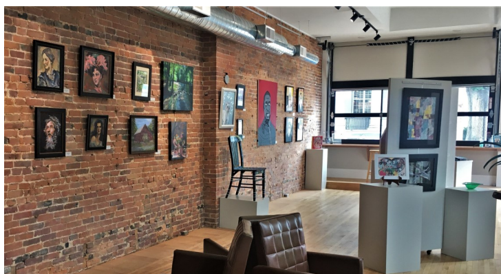
Council for the Arts' "Community Show" 103 North Main Street, Chambersburg

Nancy Horton Heefner Memorial Art Show at Mercersburg Academy is postponed until 2021.