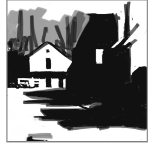
Landscape & Preliminary Notan Drawing, Julie Riker