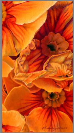
Amy Lindenberger: Ensneced

The Alliance's March meeting will be held on Saturday March 8 , from 1-3pm (12:30 social time) at Grove Family Library (101 Ragged Edge Road South in Chambersburg). The business meeting will begin at 1pm and the program will follow, featuring a demonstration in colored pencil by Amy Lindenberger. Colored pencil is a very versatile medium which can be applied to many different surfaces, and drafting film is one that is very effective. Due to its translucent nature, it allows the artist to work on both front and back. It is also an incredibly sturdy material, completely archival, 100% erasable without disturbing the tooth of the surface, and produces a very luminous result. Come learn methods and tips for creating beautiful colored pencil renderings on this unique surface!