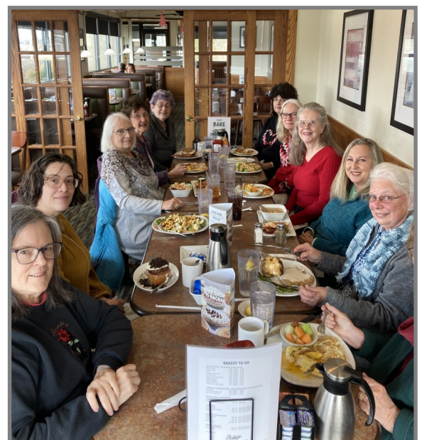
FCAA Christmas Lunch: This group gathered on December 21st, after our Holiday Party was cancelled due to wintry weather!